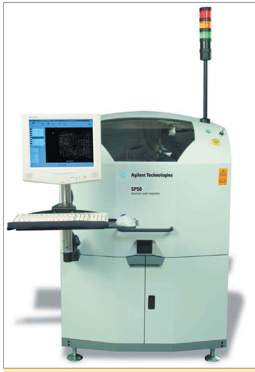
Figure 2: High Speed 3D In-Line Solder Paste Inspection (Agilent Technologies)

Solder paste inspection options Which approach makes best sense for Solder Paste Inspection? There are several decisions on which direction to take: